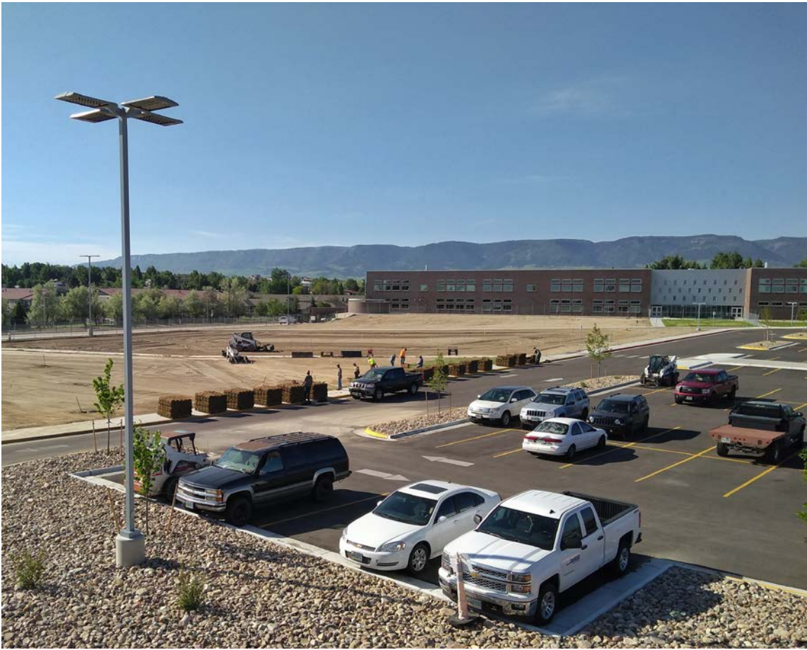
New sod installation (first parcel) between pool and main building (east of student parking lot)