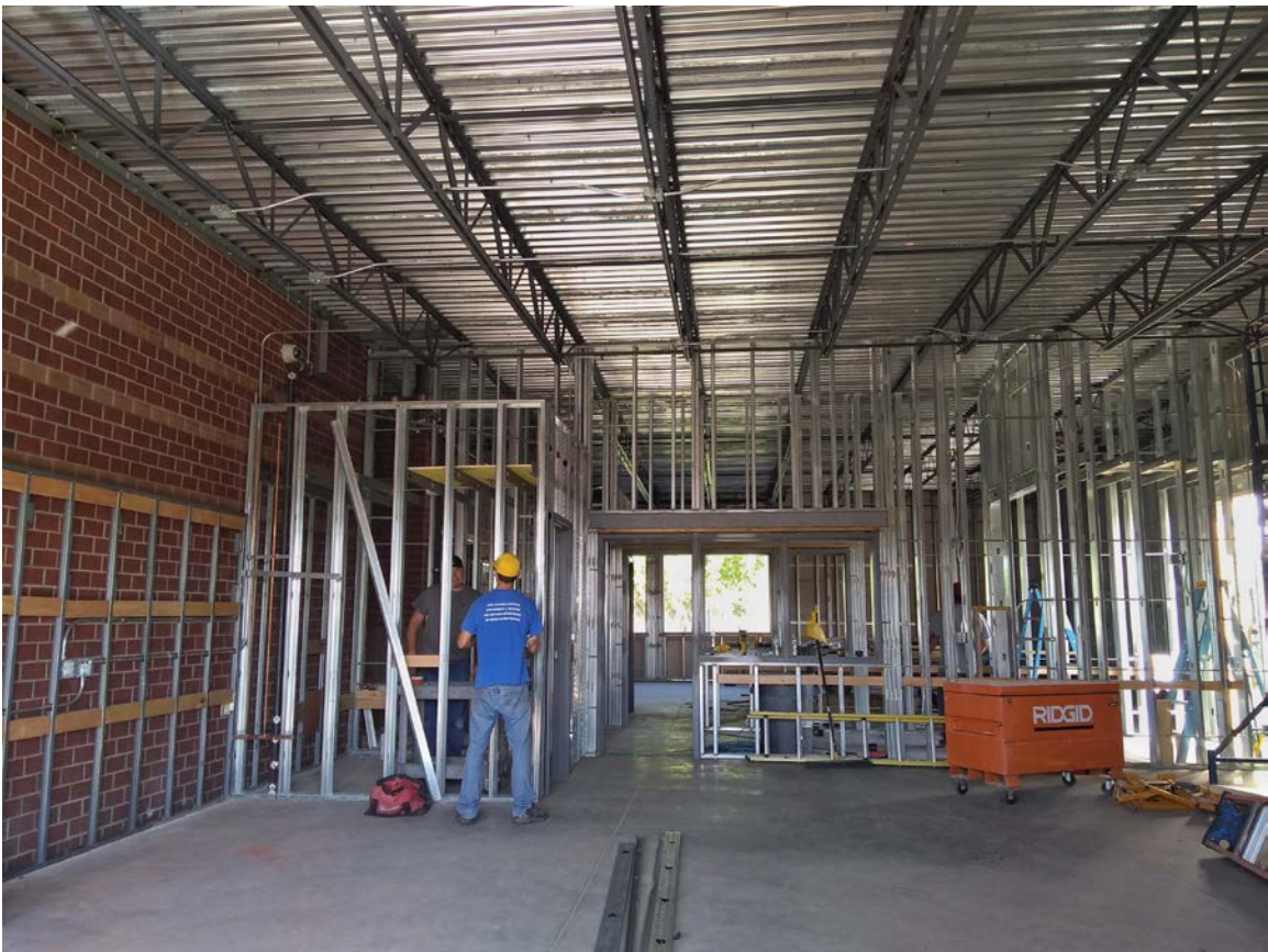
Interior wall framing