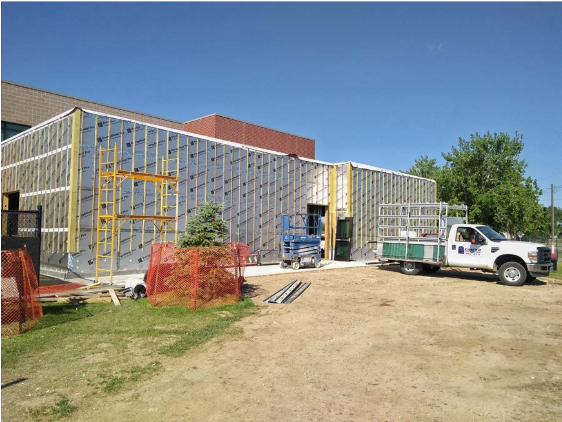
Lincoln Pre-School Classrooms (NE Exterior view)