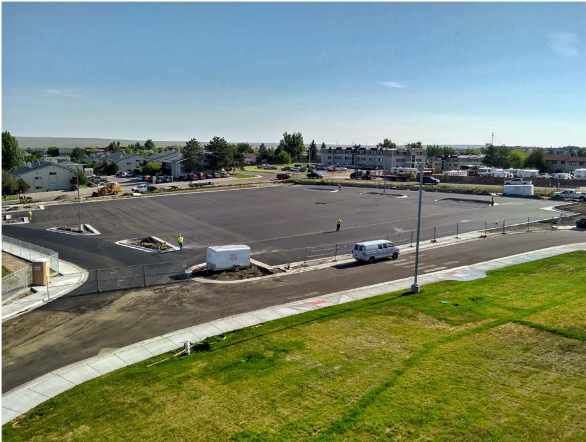
New north parking lot (ready for striping)