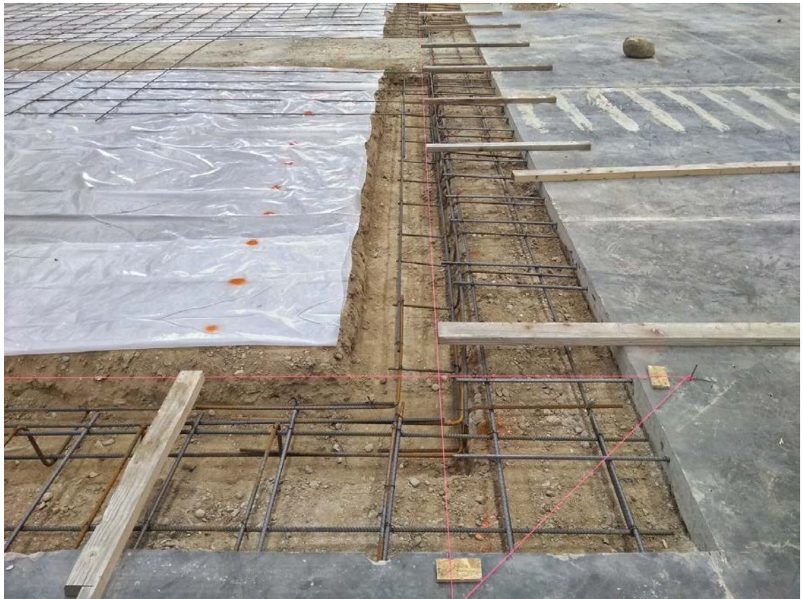
Close-up view of depressed slab area